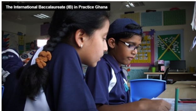
A THINKING ROUTINE FROM PROJECT ZERO, HARVARD GRADUATE SCHOOL OF EDUCATION