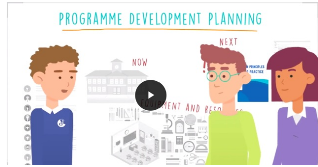
Programme Development Planning Nano PD and Explanatory Video (Sign-in to My IB to access resources.)

3 Now What?> Making a Plan for supporting a Movement around a Mission: We looked resources that could help support our school community in learning about the Programme Development Planning (PDP) process. A See, Think, Wonder thinking routine could be used along with the video resource to help engage members in our school context in seeing the purpose and positives of creating a PDP around implementing the IB Mission with more depth and understanding. Next, we considered the standards and practices framework to see how we might organize the practices for the CONDITIONS needed for the PDP, WHO would be involved, and HOW the actions would be approached, followed by what this would look like on the PDP form .